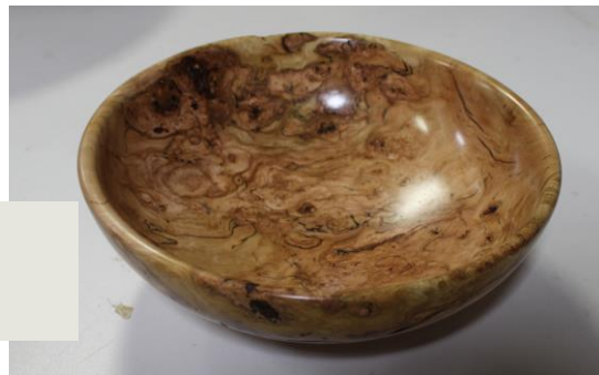
Cherry burl bowl, finished with Renaissance wax