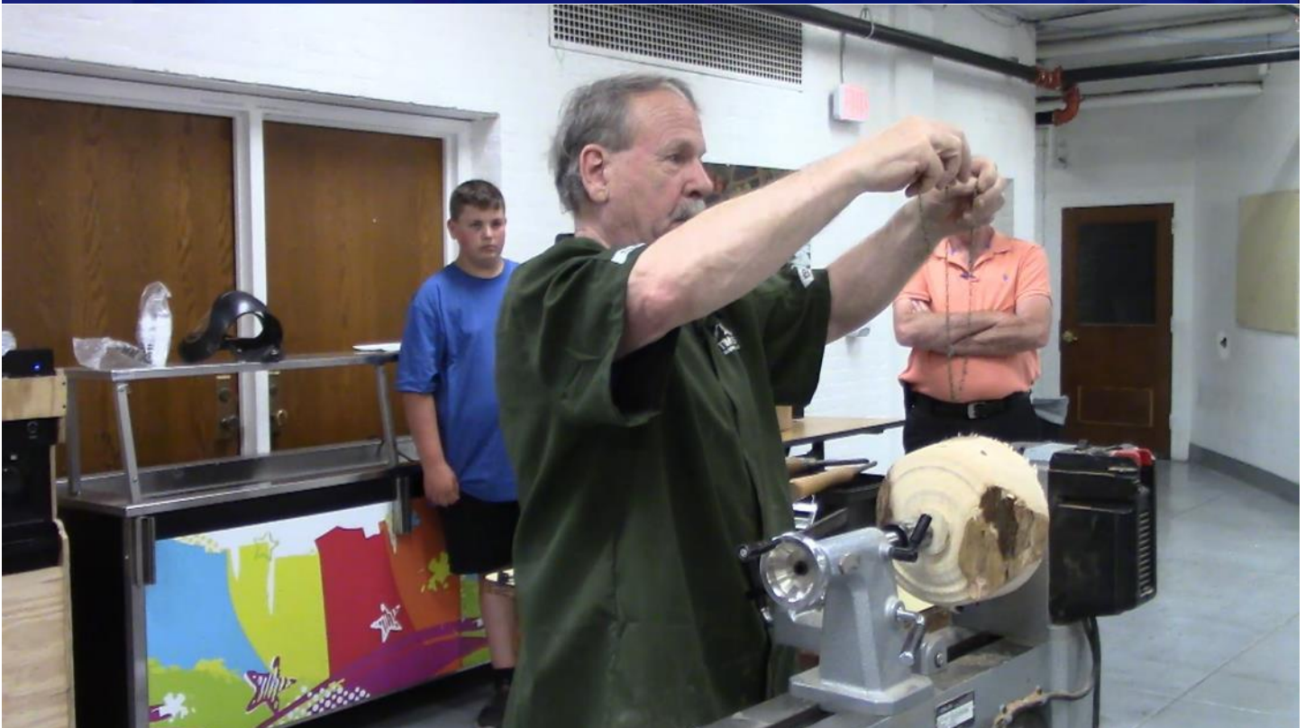
Tricks to Avoid Sanding