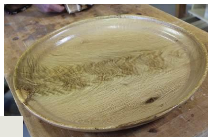
Large Oak platter