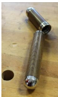
Emerging goblet with live-edge base, Ambrosia Maple bowl, and Walnut cigar case