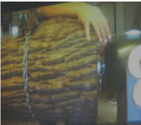
Faceplate mounted blank is supported by a chain hoist while it is secured onto the headstock

He ended his demonstration with a 9 minute "speeded up" video he made of hollowing one of the vessels he brought to the meeting.