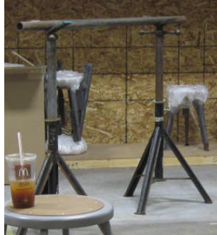
Support for hollowing tool