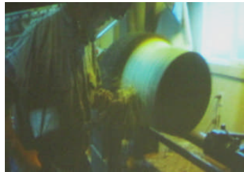
Shaping is done in stages