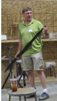
Large hollowing tool