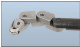
Munro tool as pictured in Packard catalog