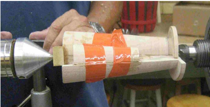
Reassembled turning mounted on lathe for further turning