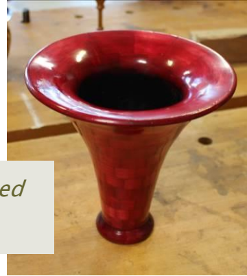
Pine segmented vessel and oval-shaped goblet design