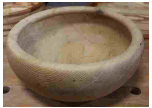
Joe Doran showed a 12” bowl of White Ash finished with Walnut oil. The wood came from some trees that were felled in Hurricane Irene.