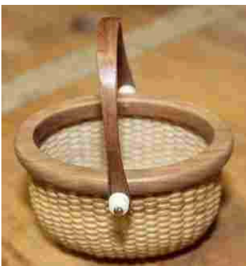
Gail Connolly – “This is my first mini basket. It is also my first time using a water-based finish versus oil-based poly”.