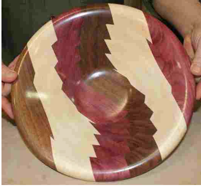
Ed Keenan showed a bowl made from Purpleheart, Maple and Black Walnut - it is 13" by 4" with 4 coats of wipe on poly