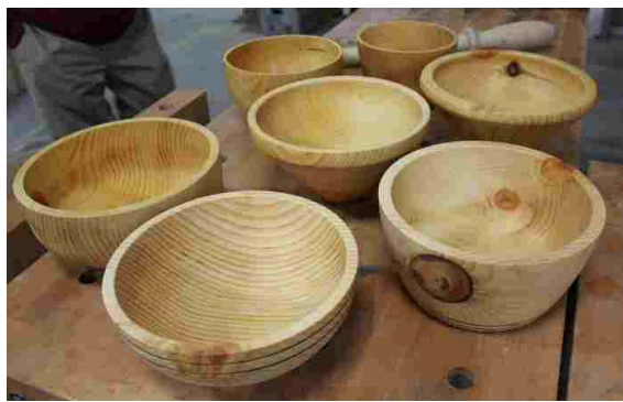
Jeff Mee showed 7 bowls made from a pine tree that fell into a lake in NH. It was under water for about 12-15 years. All are finished w/Watco natural oil finish.