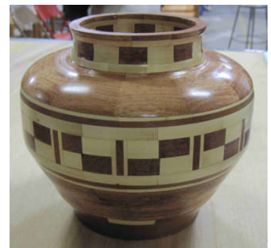
Paul Tavares - segmented vessel made of Holly, Mahogany, and Bloodwood. It is 7" high and 8" diameter.