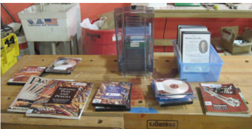
Our library has books and DVD's on pen making and other aspects of turning