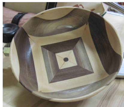
Chuck Petitbon - first segmented bowl. It is 8" diameter and 2" high and made of Maple & Black Walnut.