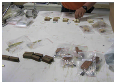
Preparing the kits for turning