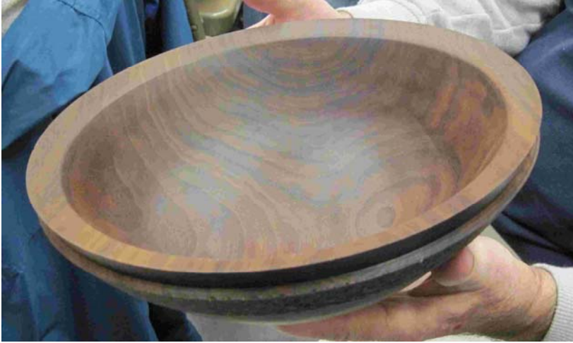
Mike Murray showed a Walnut bowl with a textured rim