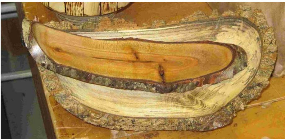
Bernie Feinerman showed two banana bowls,( Cherry , and Hackberry)and a Maple offset hollowform with pyrography decoration