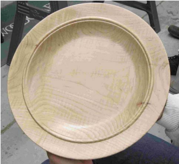
Wayne Collins showed a Maple platter