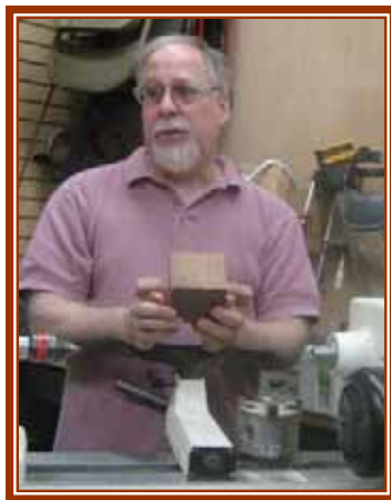
He demonstrated how to turn the individual pieces of the mace.