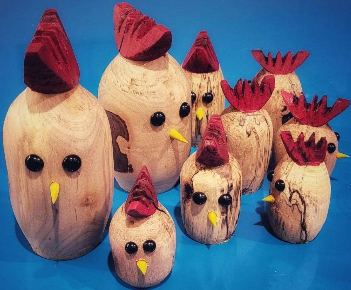
WOOD TURNED CHICKENS